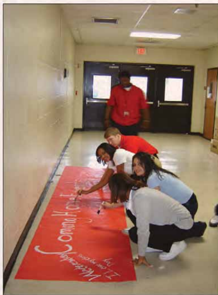
Glenncliff Developing Community Leaders students working on Coming Home Banner