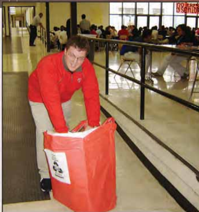
Glenclyff Developing Community Leaders student working on Recycling Project

Three students have completed the same activities during their first year of the Developing Community Leaders (DCL) class at Glenclyff High School. Now in their second year, all three have grown in uniquely personal ways.