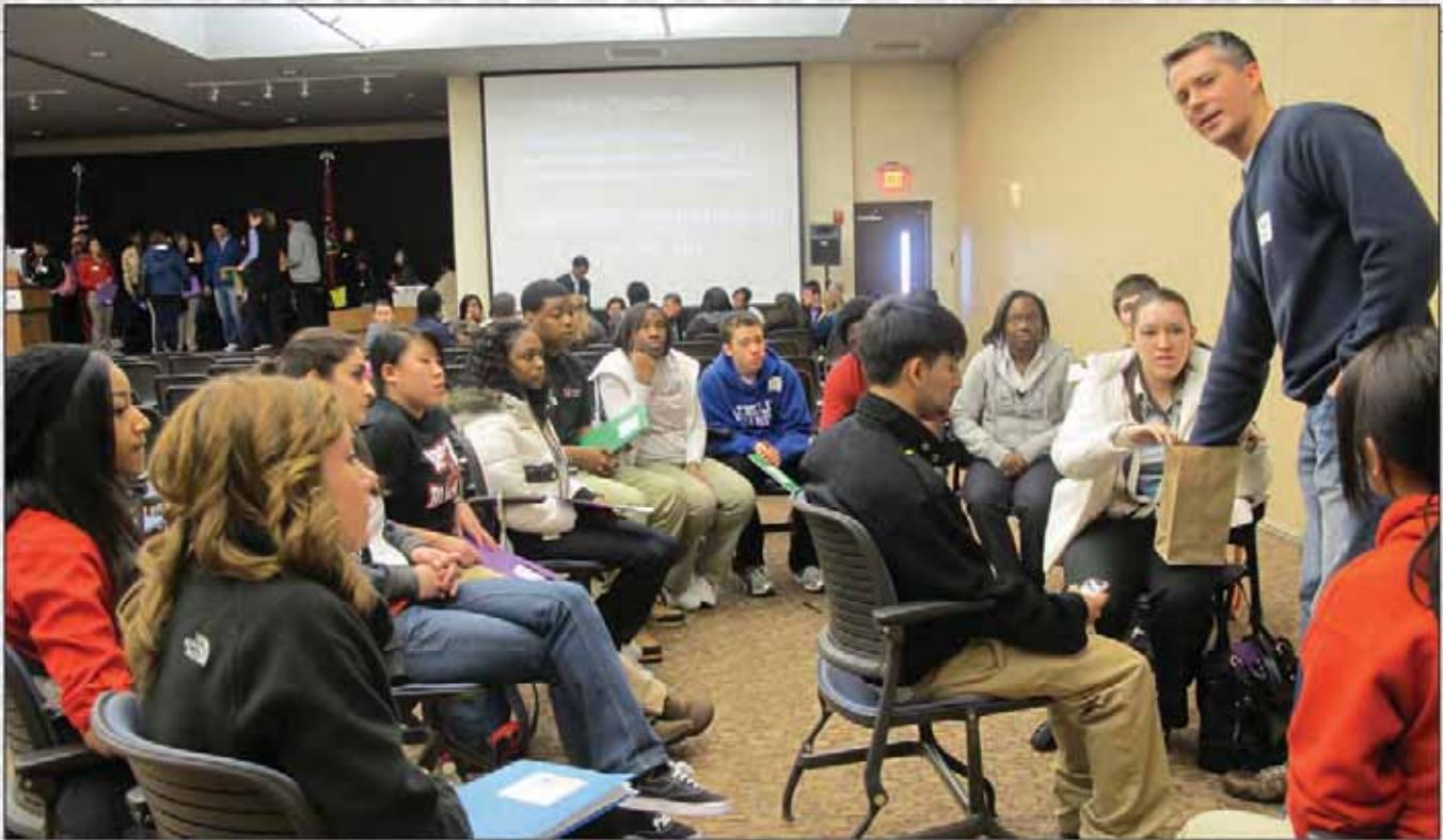
DCL students define leadership, service, and unity

were able to demonstrate and articulate their growth in more meaningful ways. We became very skilled in developing programs that specifically addressed the school's needs."