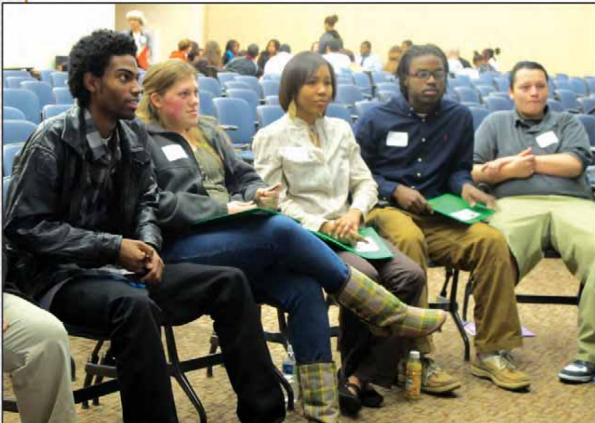
DCL students at leadership event