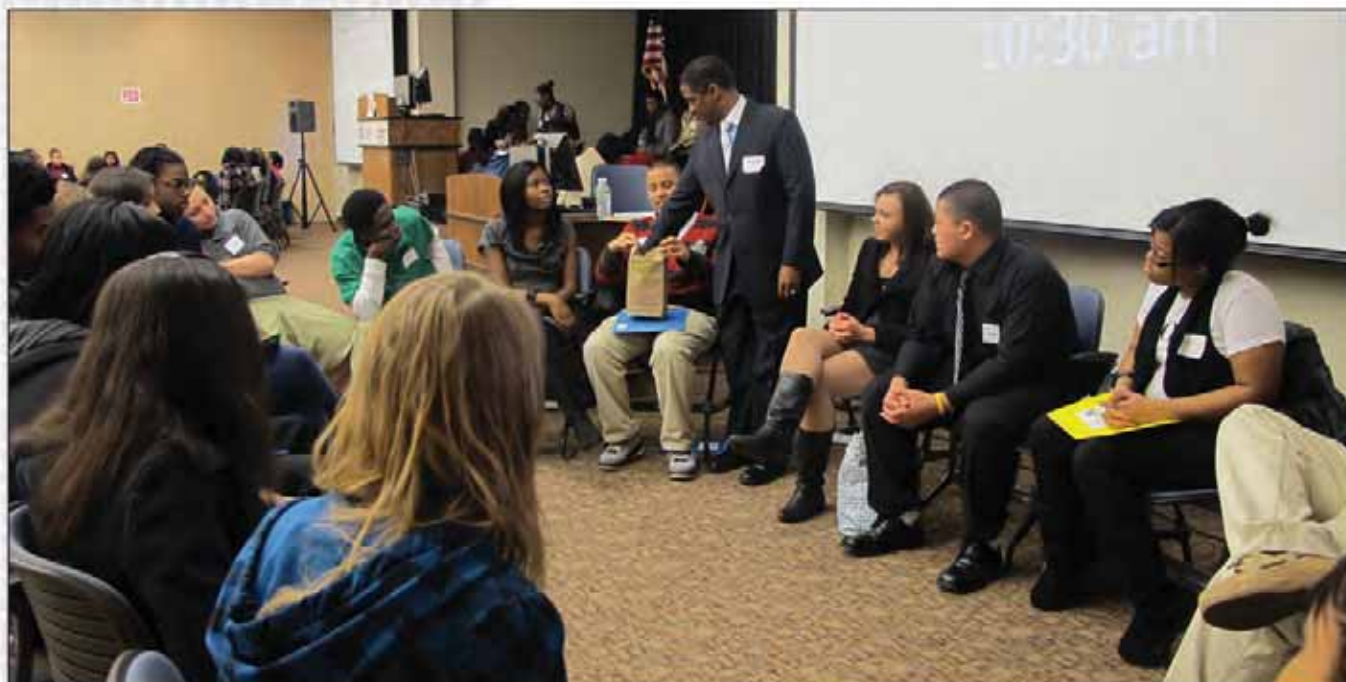
DCL students participate in a leadership development activity