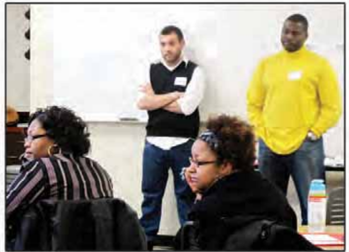
Developing Community Leaders Teachers at Professional Development Workshop