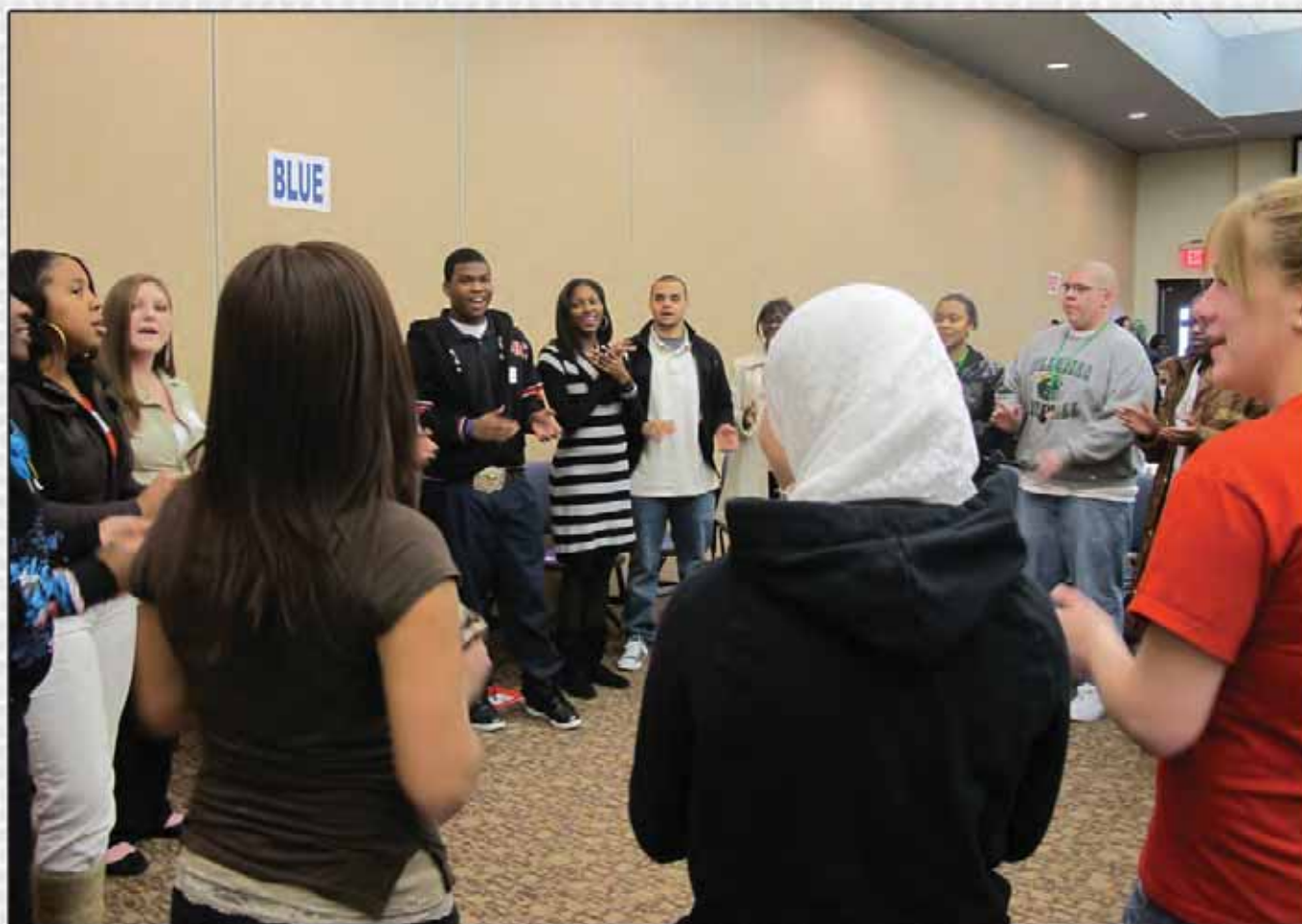
DCL students participating in an icebreaker activity