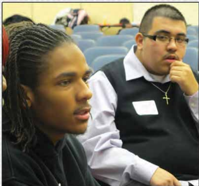
DCL students discuss service-learning projects

Community resources are essential for DCL classes to fulfill their mission. Community volunteers can help students hone essential skills such as public speaking, while organizations and businesses are invaluable partners as students organize and complete their service learning projects.