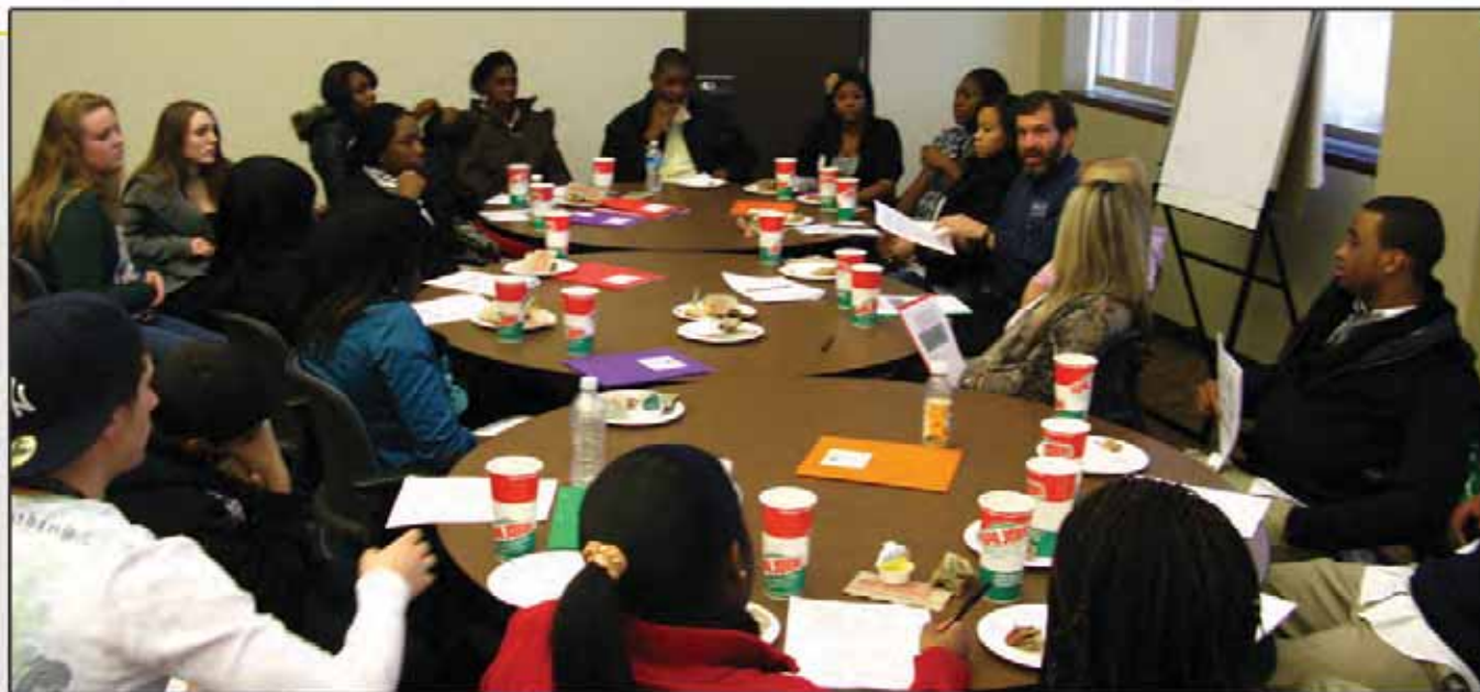
DCL students prepare presentation on the service-learning cycle