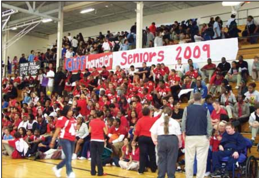
Students pictured at a kick-off pep rally at Glencliff High School in September 2008 for the Live It! Go for the Red, White, and Blue program, a collaborative initiative of Vanderbilt Children's Health Improvement and Prevention Program of the Monroe Carell Jr. Children's Hospital, Alignment Nashville, and Metropolitan Nashville Public Schools (see page 20 for more details).

In 2006, AN worked with MNPS to obtain a grant from the state of Tennessee to implement Coordinated School Health (CSH) across the district. Through the Alignment Nashville Healthy Practices Committee, the Children's Health Executive Oversight Committee serves as the community's Advisory Council for Coordinated School Health.